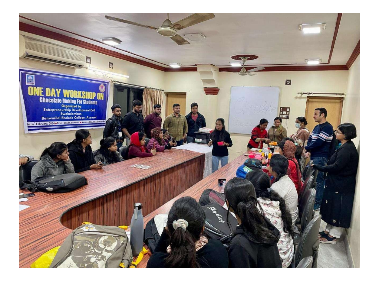
Stuydents taking part in the workshop on Chocolate making